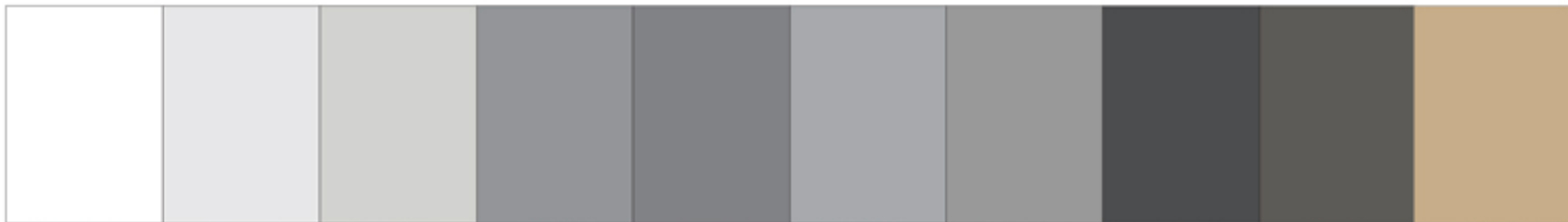
3X1-204* Bright White 3X1-305 Light Grey 3X1-306 Pearl Grey 3X1-595 Driftwood 3X1-331 Grey Flannel 3X1-301 Grey 3X1-308 Silver Grey 3X1-307 Charcoal Grey 3X1-413 Cinder 3X1-831 Beige