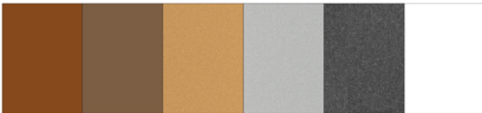
3X1-891 Copper 3X1-871 Deep Bronze 3X1-771 Gold 3X1-304 Silver 3X1-398 Graphite 3XX-101 Clear