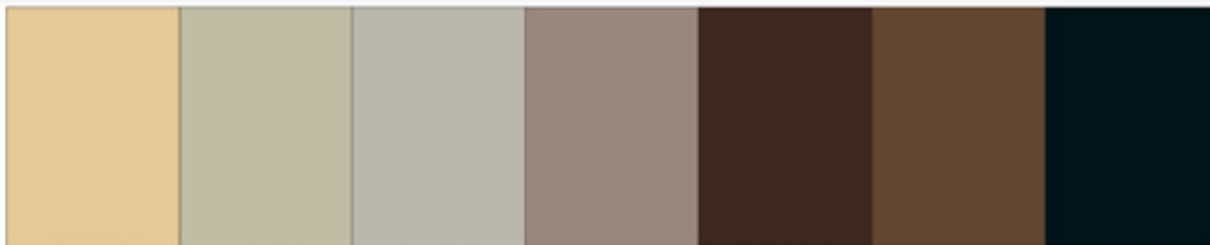
3X1-851 Desert Sand 3X1-805 Candlewick 3X1-806 Putty 3X1-802 Taupe 3X1-803 Dark Brown 3X1-821 Med. Brown 3X1-401* Black