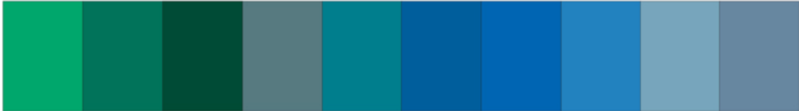
3X1-901 Bright Green 3X1-902 Pine Green 3X1-991 Hunter Green 3X1-903 Black Forest Green 3X1-509 Bahama Blue 3X1-501 Blue 3X1-506 Sapphire 3X1-571 Light Blue 3X1-521 Coastal Blue 3X1-302 China Blue