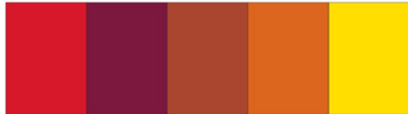
3X1-601 Red 3X1-602 Burgundy 3X1-823 Canyon 3X1-603 Orange 3X1-701 Yellow

This matte finished product line is specially designed by Rowmark to comply with the federal regulations for tactile signage in the Americans with Disabilities Act (ADA). These Braille-engravable, routable sheets come in a wide variety of colors to match any project.